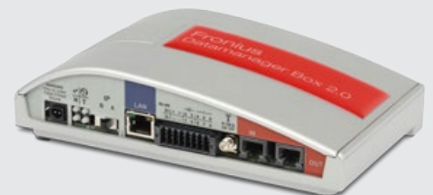
/ Fronius Datamanager Box 2.0